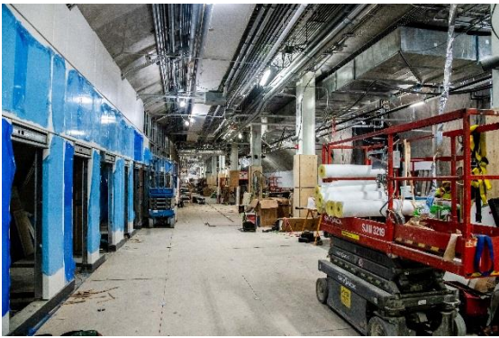
Parliament Station – ticket machines roughed-in, August 28, 2018