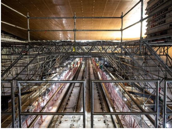
Rideau Station - scaffolding in the tunnel, August 28, 2018