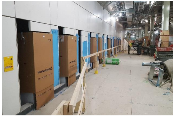
Parliament Station – ticket machines being installed, September 26, 2018