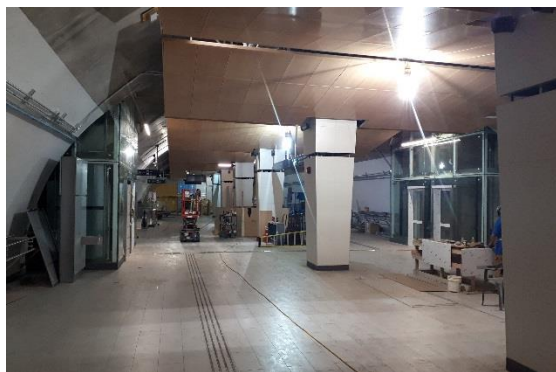
Lyon Station – concourse, September 26, 2018