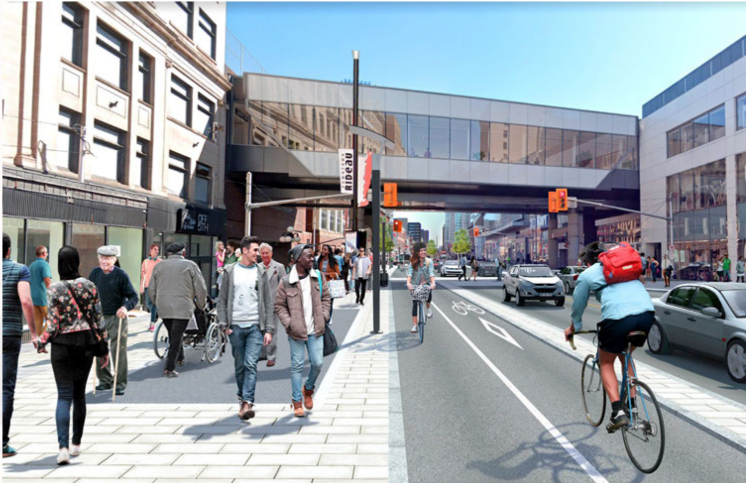
Future Rideau Street