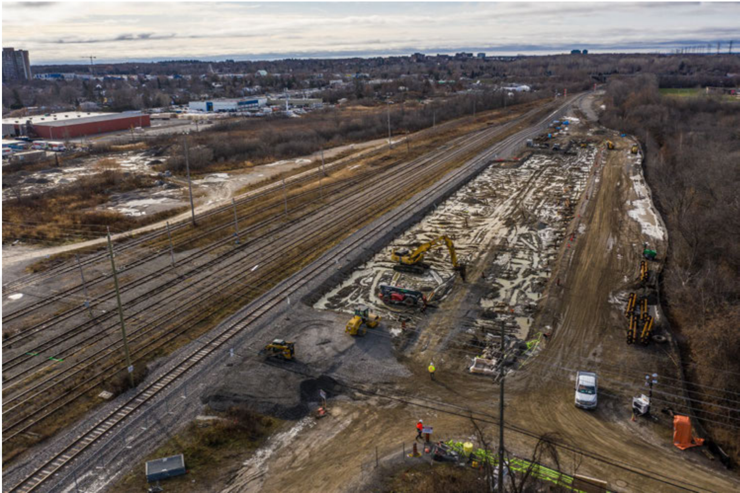
Walkley Maintenance and Storage Facility Progress